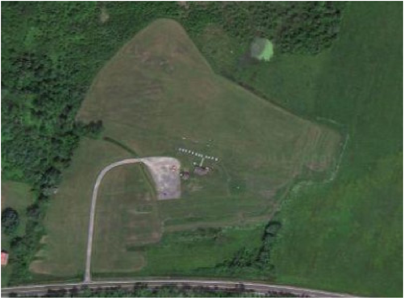
STARS Field Satellite photo